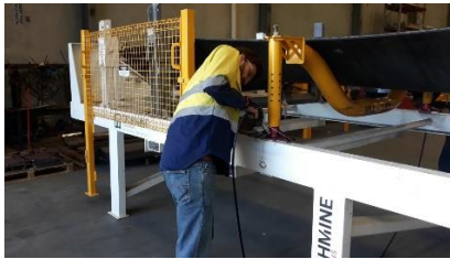
Connect hydraulic hoses (b) to hydraulic telescope (c)