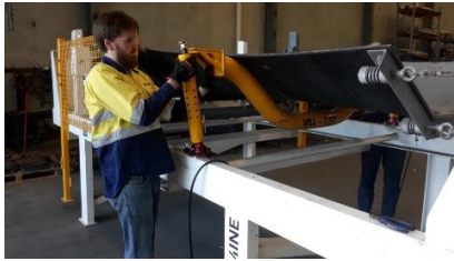
Position lifting beam (a) as centrally as possible