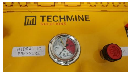
Ensure hydraulic pressure gauge on pump reads 0