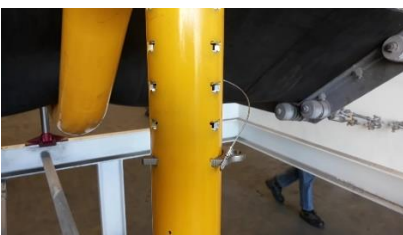
Lower lifter onto locking pin