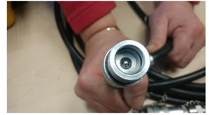
Ensure hydraulic hoses are clean before connecting