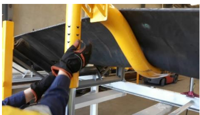
Slide in locking pin to secure load