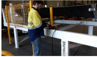
Stand up left and right telescopes (c)