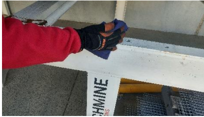
Wipe down stringer