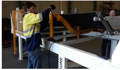
Install and tighten M24 securing nuts (¼ turn)