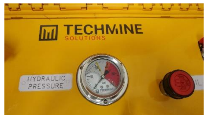
Monitor lift using hydraulic pressure gauge