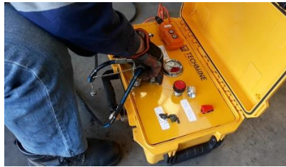
Connect hydraulic hoses (b) to hydraulic pump (e)