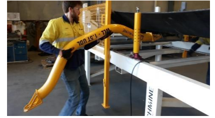
Pass lifting beam (a) under conveyor