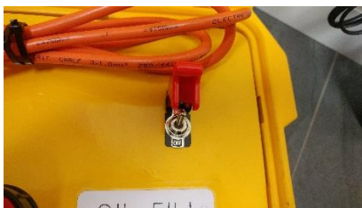
Flick isolation switch to "ON" position