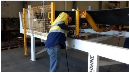
Connect converter pack supply lines (b) to hydraulic telescope (d)