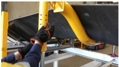
Slide in locking pin to secure load