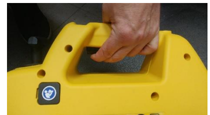
Depress trigger to operate pump and lift cylinders