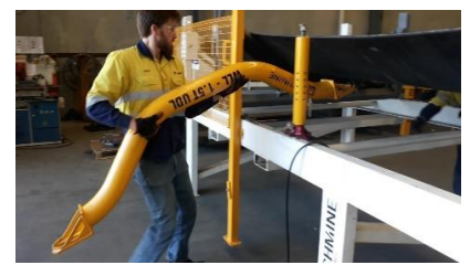
Pass lifting beam (a) under conveyor