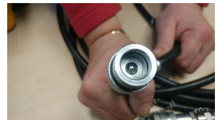
Ensure hydraulic hoses are clean before connecting