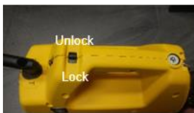
Switch trigger lock out to unlock position