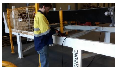
Stand up left and right telescope legs (d)