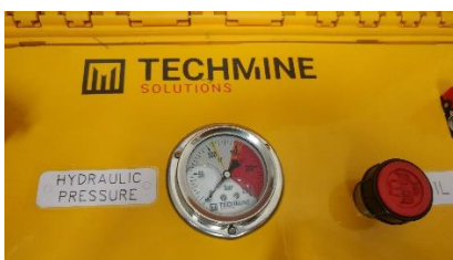
Ensure hydraulic pressure gauge on converter pack reads 0