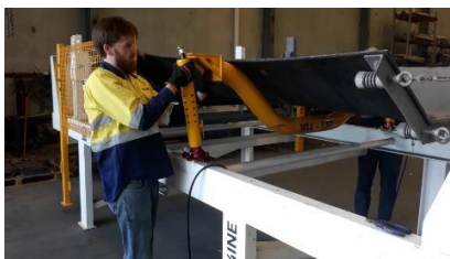
Position lifting beam (a) as centrally as possible