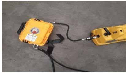
Connect hydraulic portable pump (f) to Techmine converter pack (e) using hydraulic hose (c)