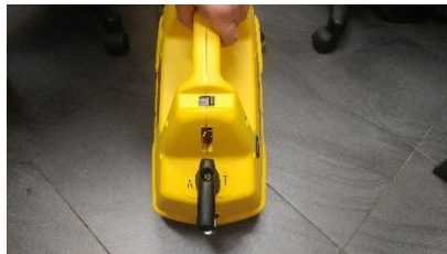
Orientate "T" bar handle to "T" position to lower cylinders