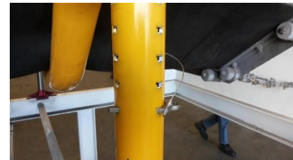
Lower lifter onto locking pin