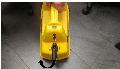
Orientate "T" bar handle to "A" for operation