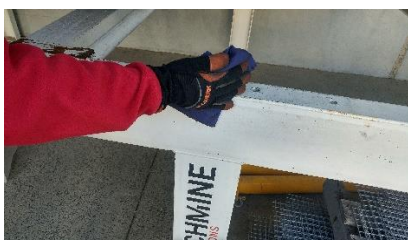
Wipe down stringer