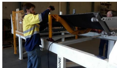
Install and tighten M24 securing nuts (¼ turn)